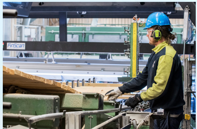
A new trimmer system will increase productivity at Bollsta Sawmill.

“Through the increased volumes from Bollsta and consolidation of volumes from other shippers, we can continue to build cost-effective logistics systems. This will, for example, contribute to larger container feeders to Rotterdam, linking northern Sweden to every corner of the world,” says Nils-Johan.