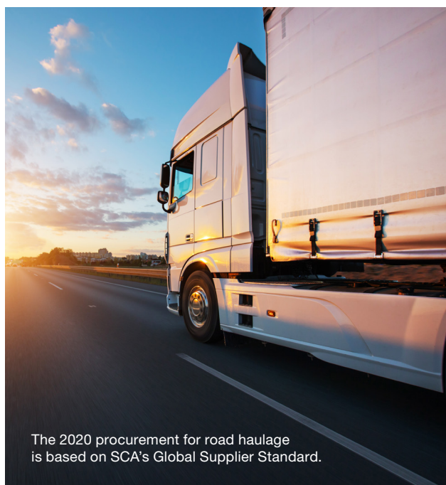
The 2020 procurement for road haulage is based on SCA's Global Supplier Standard.