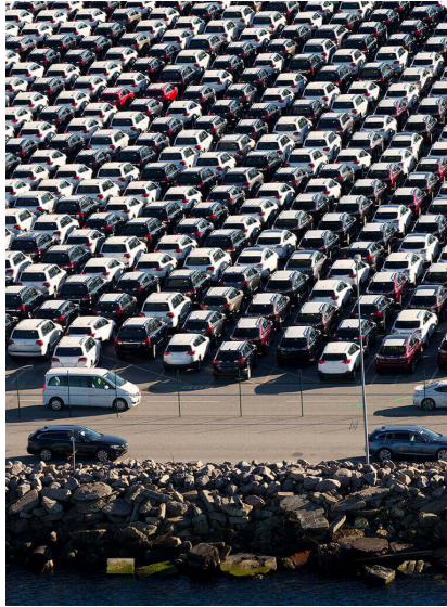
Over 300,000 vehicles arrive to the Port of Malmö each year.