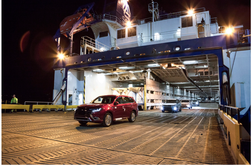
Around 100 vehicles are shipped to Sundsvall and Umeå each week via SCA's RoRo loop.

The Port of Malmö on the southwest tip of Sweden is operated by Copenhagen Malmö Port AB (CMP), which also operates the Port of Copenhagen. Car imports constitute a large part of the port's cargoes, with over 300,000 vehicles arriving in Sweden via this route each year. This makes Malmö the largest port of entry for vehicles into the Nordics.