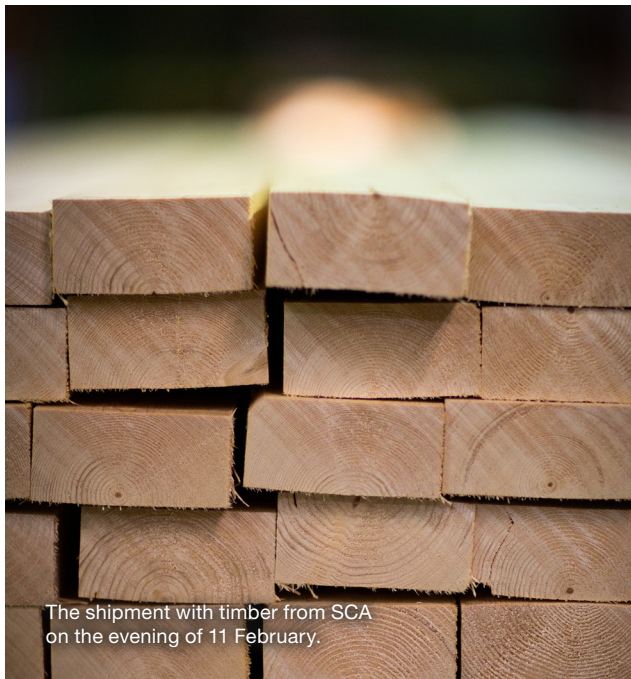
The shipment with timber from SCA on the evening of 11 February.