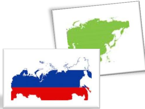
Asia crisis + Russia